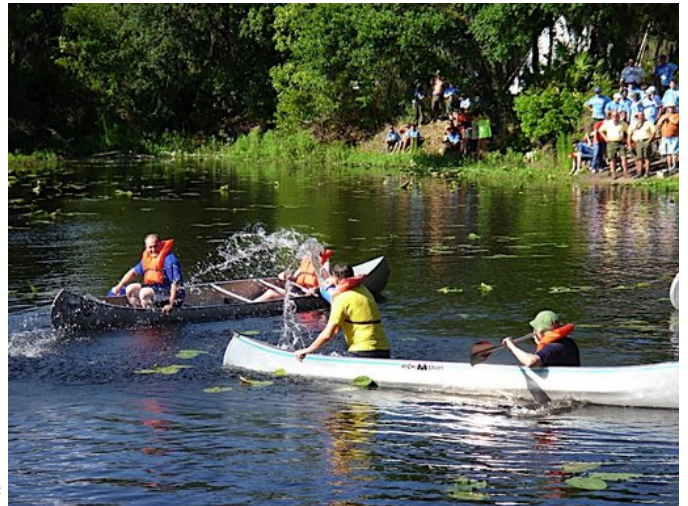
The section watches in on the Advisor Sink-a-thon, the Hallmark of section competition