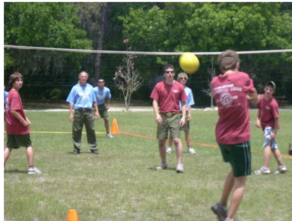
O-shot-caw and Echockotee square off in a first-round volleyball game. O-shot-caw would eventually win the tournament.