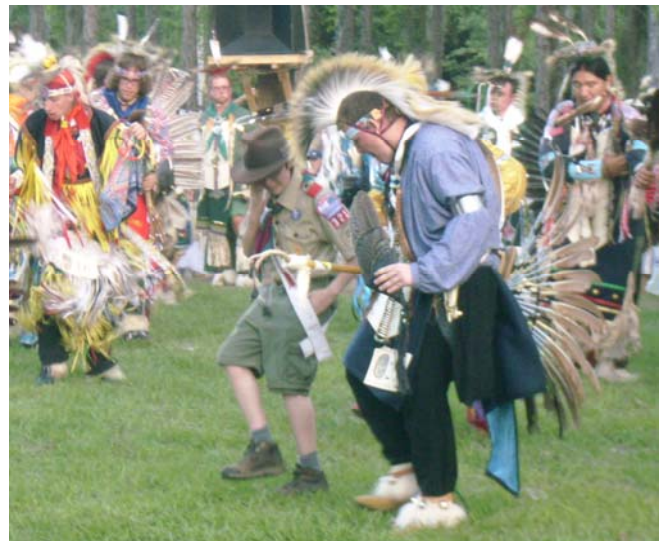
Scouts dance together at the Festival of Feathers Pow-wow.

That night scouts enjoyed another show, this time in the camp's large new, state-of-the-art amphitheater. The show featured both previously recorded and live comedic sketches, plus lots of cheering from the audience. The next morning, the lodges got to find out how they performed over the weekend, as the good weather held out long enough for the section to present awards for all of the evaluations and competitions, and even elect new officers. As the trailers pulled out of the camp and the clouds began to drop their rain Sunday, several hundred scouts left camp, tired, but quite contented.